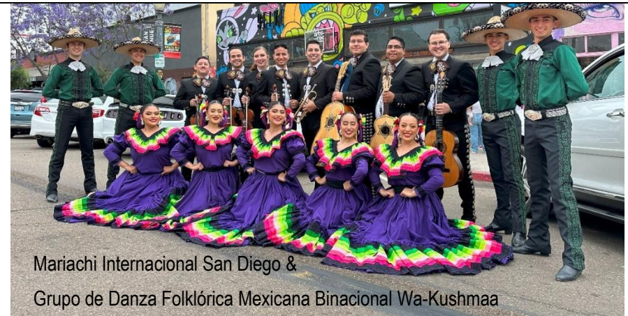
Mariachi Internacional San Diego & Grupo de Danza Folklórica Mexicana Binacional Wa-Kushmaa

Best-Decorated Table: An award will be presented to the best-decorated table, as judged by members.